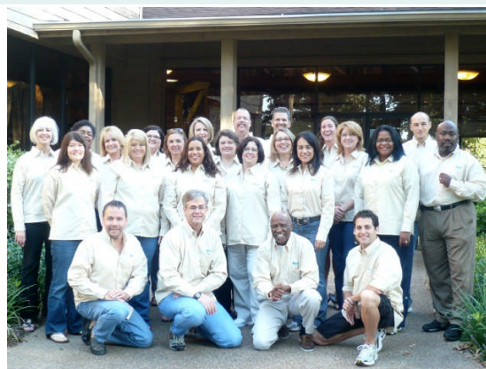
Class of 2010-2011 at their retreat