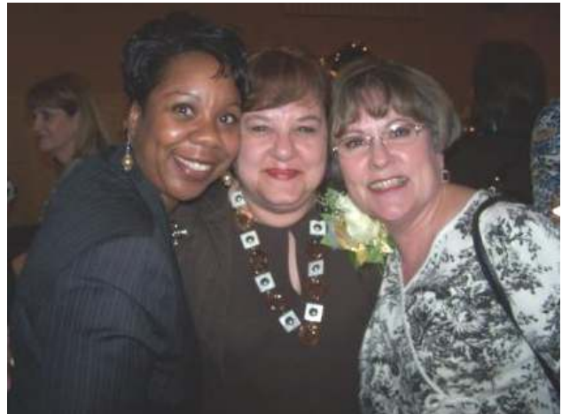
Distinguished Community Leadership Award

The evening also included a raffle which raised more than $1,900 in scholarships.