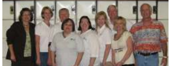
"Most Spirited Team" at Cy-Fair Ten Pin Challenge

Chamber of Commerce has an Emerging Leader Program which provides students from local colleges and university the opportunity to develop networking, and soft skills techniques which will be beneficial to them as they navigate entrance into the workforce arena. At the chamber's 15th Annual Membership/Corporate Sponsors' Luncheon and Business Expo, six students, along with their advisors, put these skills into action serving as chamber ambassadors/volunteer.