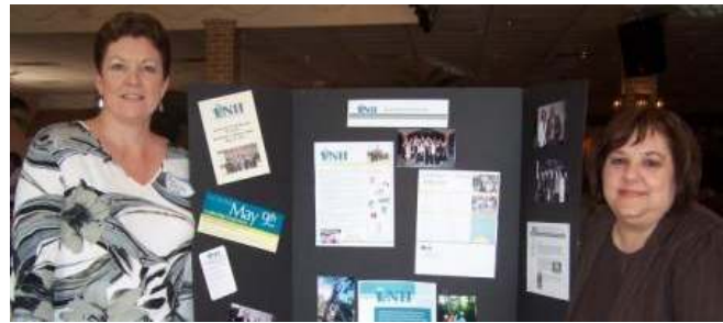
CYFEN Business Expo Booth